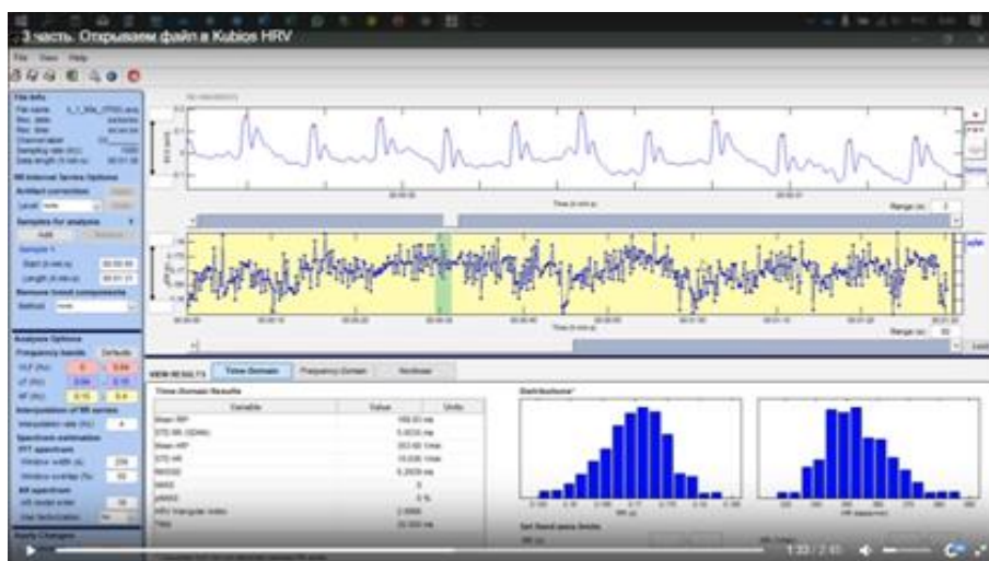
Figure 3. Example of ECG data processing in Kubios HRV.