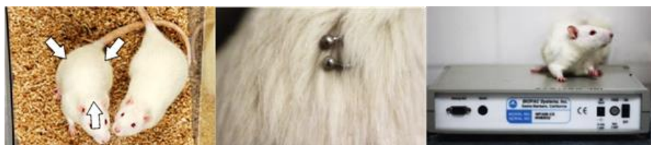
Figure 2. Scheme of applying (a) piercing (b) in rats for recording ECG on a Biopac M30-B polygraph (California, USA) (c).

Two days before the surgical intervention, all rats, under general anesthesia with a solution of Zoletil 100, were sutured with metal half-rings with capitate ends in three places - two in the back and one in the withers (Fig. 2 a, b). On the day of surgery, before the intervention itself, a control ECG recording was performed for 15 minutes on a Biopac M30-B research polygraph (California, USA). At the same time, the rats were in a free state. After the operation, the ECG was also recorded for 15 minutes daily for 6 days.