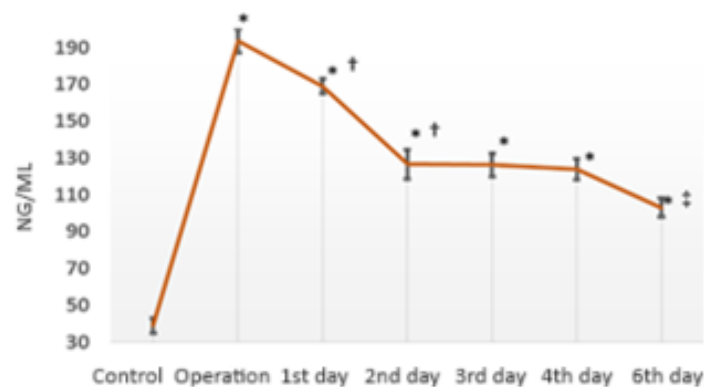
Figure 5. Dynamics of changes in the concentration of corticosterone in blood plasma in rats before and after the simulation of septoplasty. Note: * - significant differences between preoperative data (control) and post-operative data at p < 0.001 ; † - significant difference between postoperative follow-up periods at p < 0.001 ; ‡ - significant difference between postoperative follow-up periods at p < 0.01 .